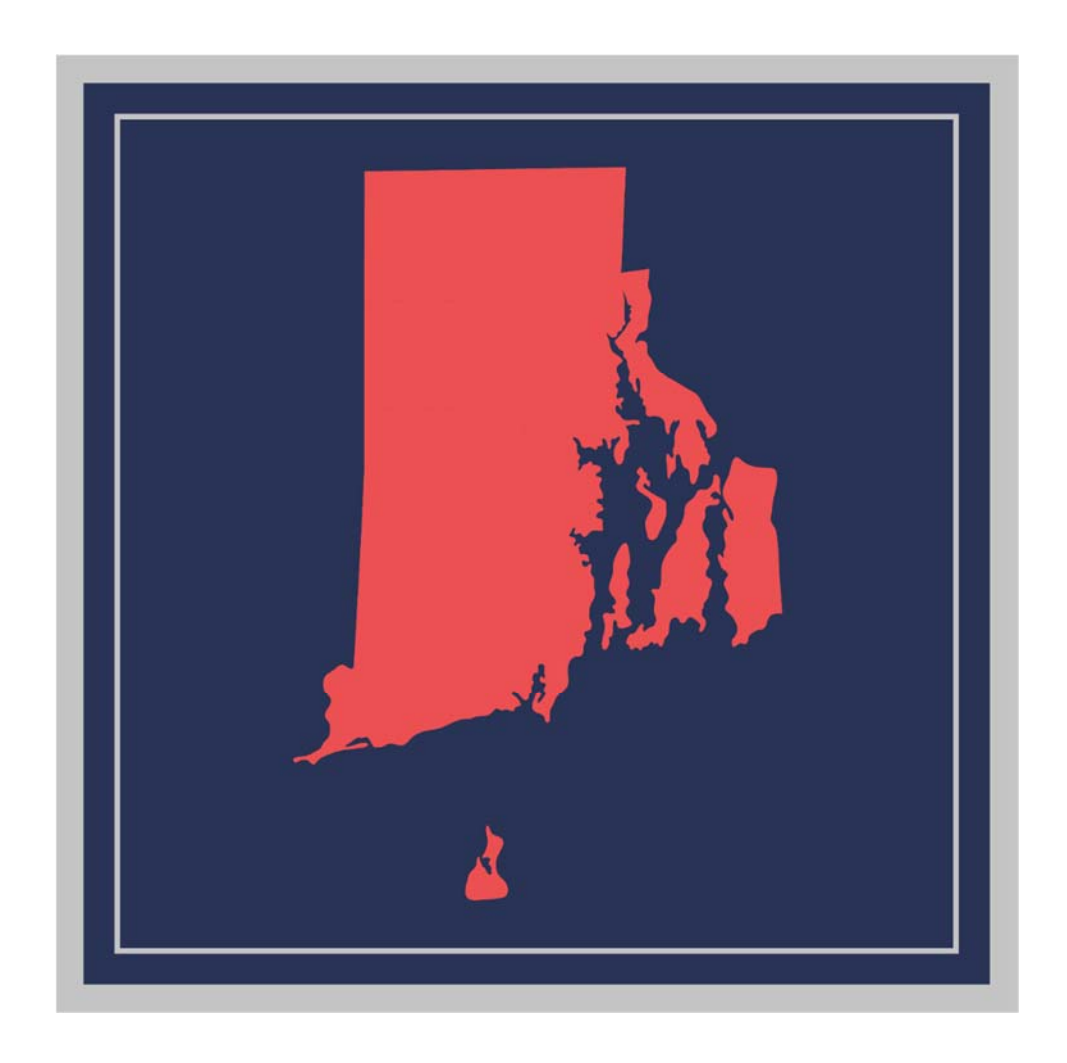
Volume IV – Public Safety, Natural Resources and Transportation Gina M. Raimondo, Governor