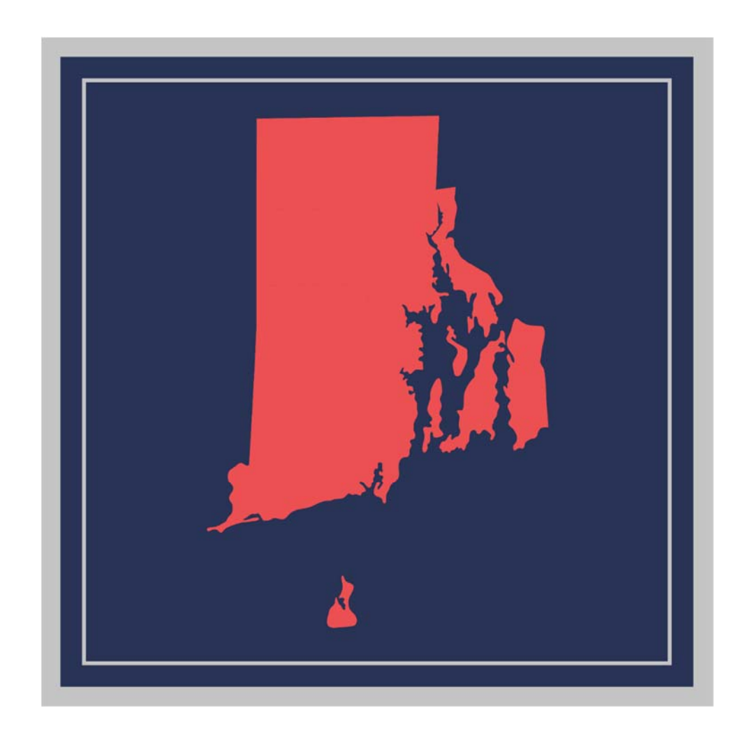
Volume III – Education Gina M. Raimondo, Governor