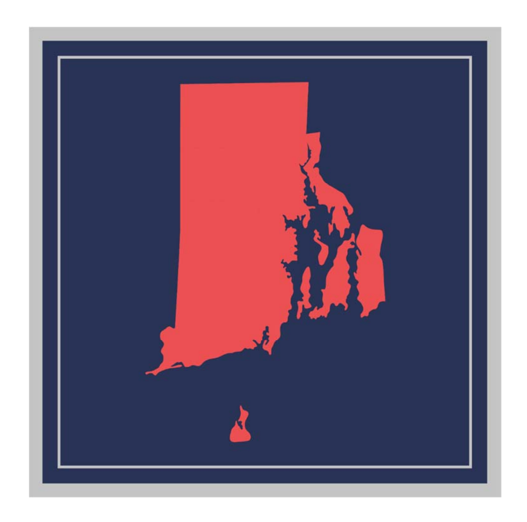
Volume I – General Government and Quasi-Public Agencies Gina M. Raimondo, Governor