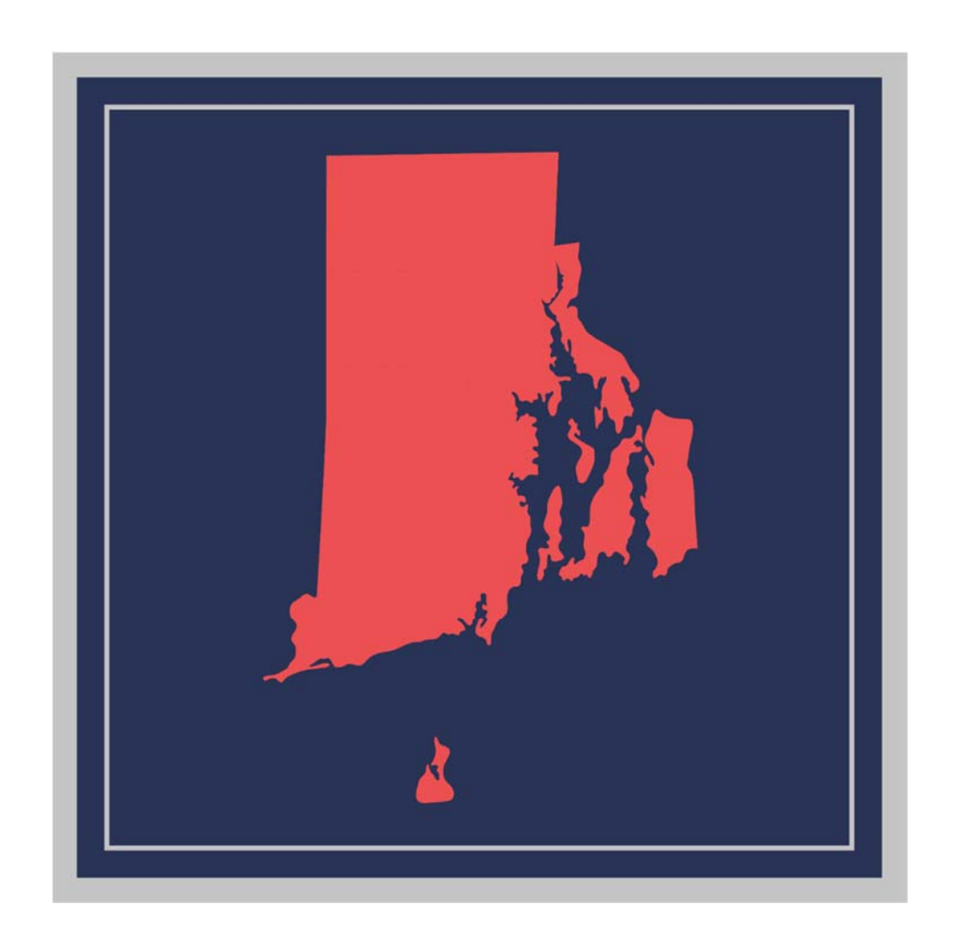
Volume I – General Government and Quasi-Public Agencies Gina M. Raimondo, Governor